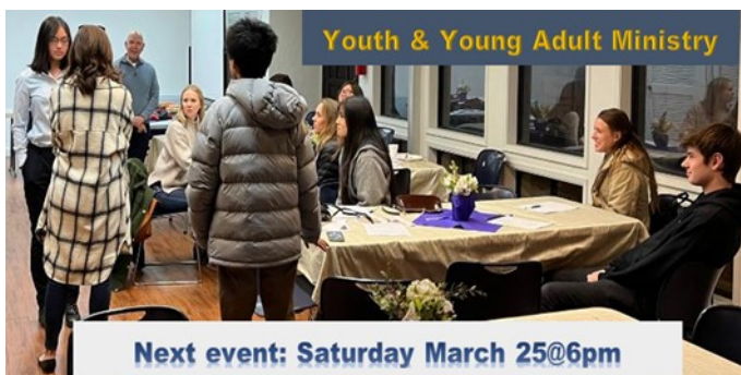
Next event: Saturday March 25@6pm

Let us continue to JOYFULLY live LENT in prayer, fasting, and almsgiving as never before. REMEMBER, we are doing so with JESUS our Beloved Savior to whom to owe EVERYTHING: our life, our breath, our all. Thank you, Jesus