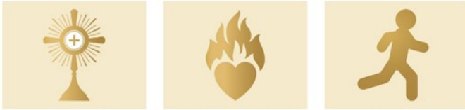
2023: Year of the Parish 2024: Year of the Renewal 2025: Year of the Mission